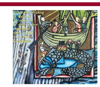
Susan Jarvis | Overhills Studios

659 West Hill Road, Putney 310-849-3780 | fionamorehose.com