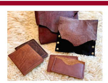
12 Anya Bredbeck

candles, and large scale oil paintings 802-722-9626 (h) 617-909-1722 (c) abredbeck@gmail.com