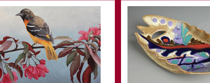
5 Lindsey Saunders

Handcrafted bath & body products 210 Canoe Brook Road, East Dummerston 802-579-8868 | puravidavt.com