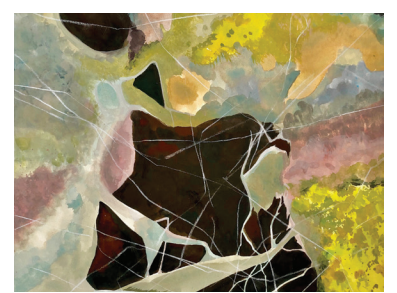
7 Fiona Morehouse Paintings and pottery

Colorful, functional and sculptural 187 Westminster Road, Putney 802-387-5995 putneycrafts.com/home/ken-pick