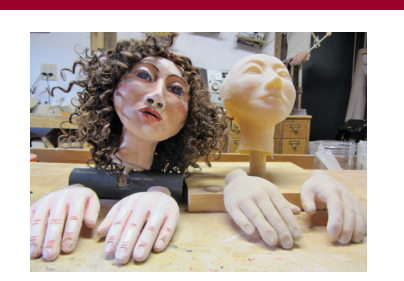
2 Sandglass Theater Handmade puppets and crankies

Artisanal wine and spirits 8 Bellows Falls Road, Putney 802-387-5925 putneywinery.com