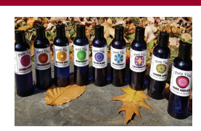
4 Pura Vida Essentials-

A cooperatively owned yarn mill, celebrating its 42nd year in operation 7 Brickyard Lane, Putney 802-387-4528 | spinnery.com