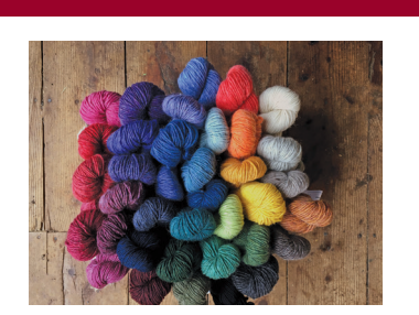
3 Green Mountain Spinnery

17 Kimbal Hill, Putney 802-387-4051 info@sandglasstheater.org www.sandglasstheater.org